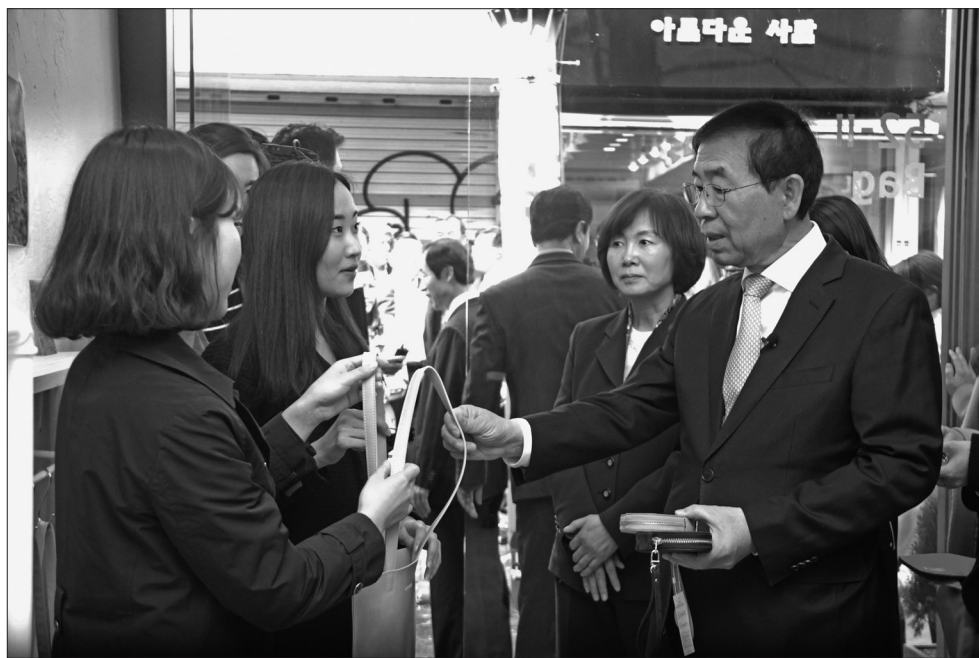
Park Won-soon, the mayor of Seoul, visited Startup 52nd St. to cheer up students who are starting their businesses. After listening to the students' explanation, he also purchased a small pouch from one of the shops.