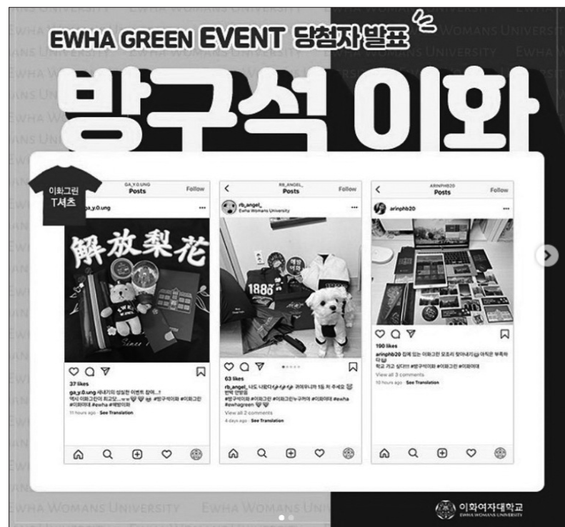
Winners of the Ewha Green Event are announced through the school's official Instagram account

For instance, when the wrong RGB of Ewha Green was used on the school website, many students proposed a correction on 'Ask for Ewha,' an online bulletin board where members of the school can express their opinions. Eventually, the school responded to the students' demand and changed the website's theme color. Since a school's identity is formed based on first impressions, students also actively uploaded photos of their Ewha Green items on social media. Reflecting students'